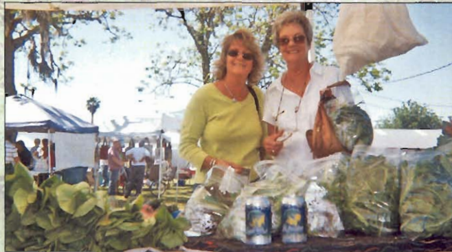
Organically grown local produce